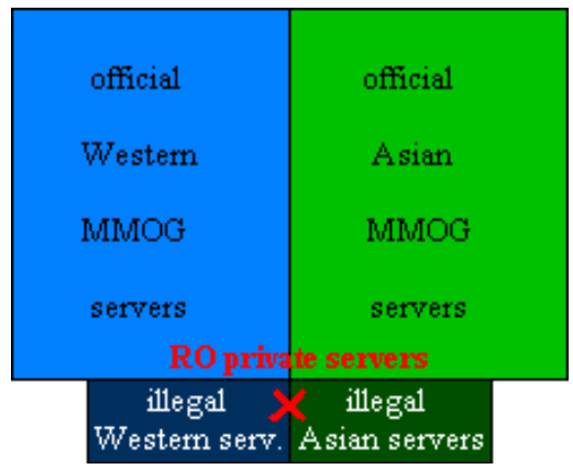
Figure 1: Localization of the RO private servers

Private servers have been studied very little, if at all. In 2009, RO's creator company, Gravity, provided servers in 15 locations worldwide and claimed the game counts more than 50 million players [9]. In addition to these official numbers, the international support board for RO private server administrators, Eathena.ws, counted more than 100,000 registered users worldwide in 2009. These numbers position the RO private server community of players and administrators between the Western and Asian MMOGs (see Figure 1).