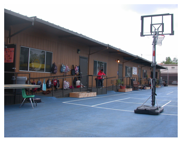
Figure 1: El Sol Academy campus

Some schools, like the one we studied, make a comprehensive effort to integrate elements of the