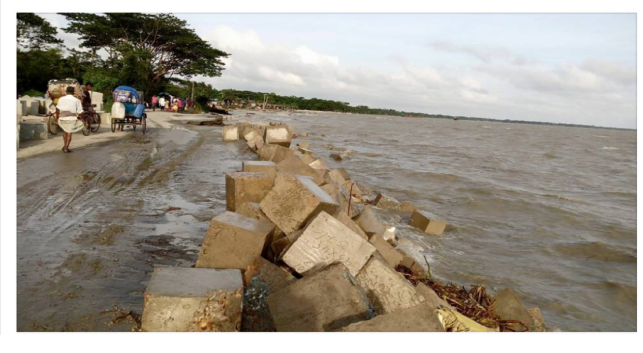
Figure 1: A Facebook post of a picture of an eroded riverbank in Ramgoti, with hashtags.

ranged from high school to college. All were native to Ramgoti and Kamalnagar. Many, however, were professionals and students based in the capital city of Dhaka, or abroad. For example, one poster whose native village was in Ramgoti, and who was educated in Dhaka, was living and working in Kashiwa, Chiba, Japan. He posted this Facebook post in English, arguing that the government should take necessary steps to stop riverbank erosion in Ramgoti: